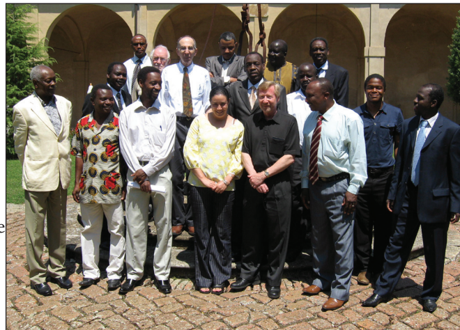
Members of the Darfur consultation gather in a courtyard in Siena.

The Institute for Conflict Analysis and Resolution (ICAR) is actively engaged in peacebuilding efforts in response to the conflict in Darfur, a conflict that has left over 300,000 dead and two million people displaced from their homes since 2003. Such peacebuilding efforts constitute a core mission of the Institute, and were given a boost in July 2009 when 17 representatives from six armed movements involved in the conflict met in a neutral setting for a consultation aimed at promoting peace in this ravaged region. The movements represented were: the United Resistance Front, the United Revolutionary