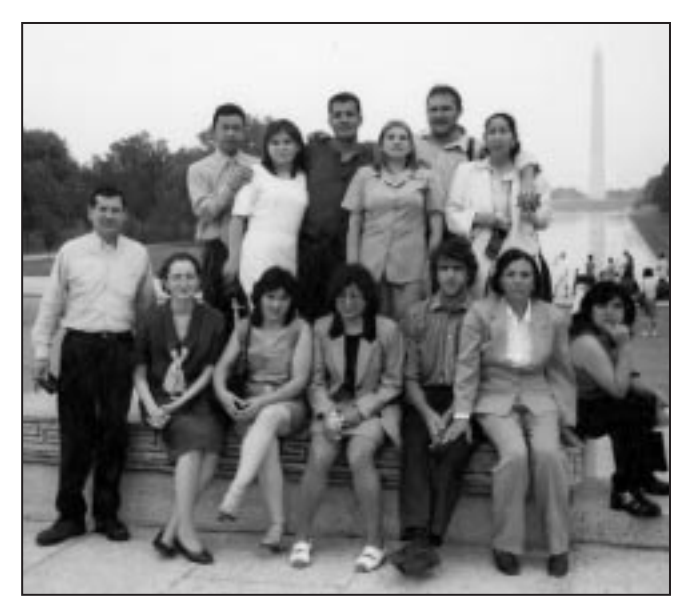
Participants in the Second OAS Summer Workshop